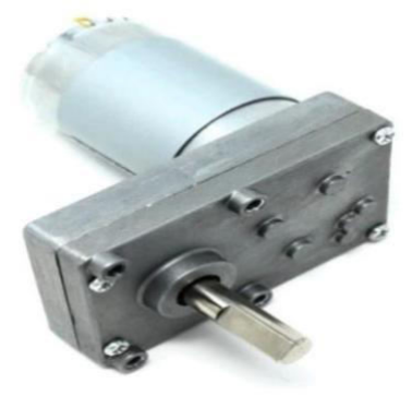
Fig -4: 12v Dc Square Geared Motor

12v Dc Square Gear / Geared Motor 10 Rpm - High Torque Is A Very High Torque Motor Which Should Be Used To Make Big Robots Or Robotised Platform. Gear Box Is Built To Handle The Stall Torque Produced By The Motor. Drive Shaft Is Supported From With Metal Bushes To Give Strength.