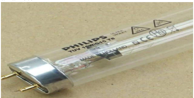
Fig -2: UV c type tube.

We are a leading stockiest & trader of Philips tuv lamps - uv-c germicidal 254nm such as Philips uv lamp tuv 16w 4p tuv 20w 4p tuv 25w 4p se unp tl mini 4pin and tuv 36t5 4p se unp also tuv 130w xpt se amalgam, Philips tuv 325 ho xpt se 4pin 325w amamotor