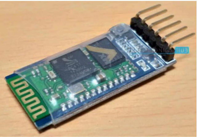
Fig -1: Bluetooth Module

Apart from Arduino, which is the main controlling module of the project, there are two other important modules that you have to be familiar with in order to implement the Bluetooth Controlled Robot project. They are the HC-05 Bluetooth Module and the L298N Motor Driver Module.