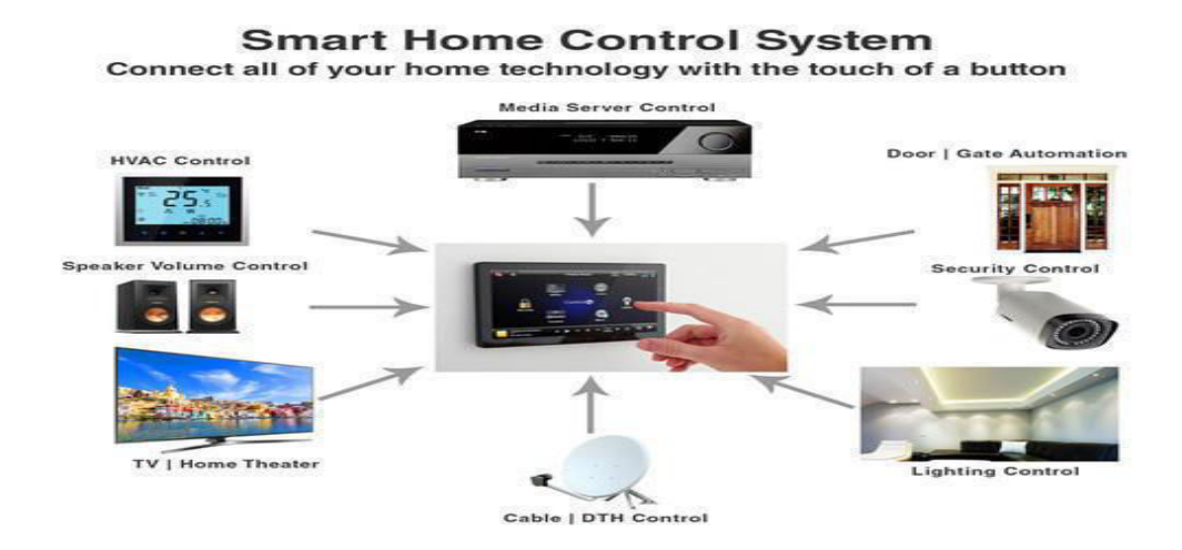
Fig 1: Smart Home Control System

The home automation is controlling of home devices from central control point, automation is todays leading project where most of the things are being completely automated. Where , every task of turning on or off certain devices and beyond, either remotely or in close proximity. The concept of this is wireless connected network such as IEEE 802.11 (Wi-Fi) . Nowadays the popularity of wireless networks at home (sensors also ) has increased a lot, and the advanced computer technology has made easy to communicate through the wireless networks. Hence, it is suitable for using RF-based location, these system to estimate location of the personal digital device in a home environment with high data transmission. Where supporting to multimedia application , it may be feasible in WLAN.