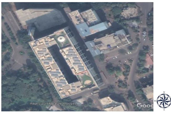
Fig 3 Building Orientation

The building is part of a business park in Navi Mumbai with Glass Façade on all the four sides of the building. It is a 17 storey Office building which houses approximately 300 offices and an occupancy of close to 3000-4000 people at a given time. Most of the