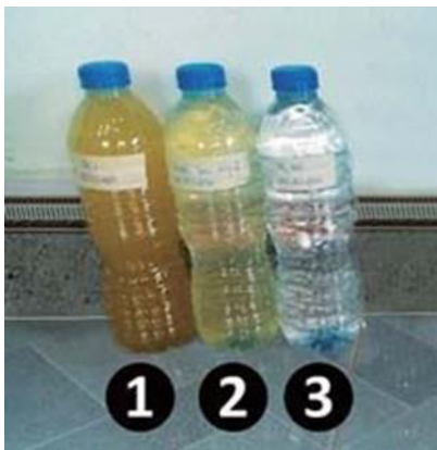
Fig: stages of filtration process

A countertop water filter is a point-of-use water filtration system. This means they can be installed exactly where you need access to water. As the name implies, many attach directly to your faucet and dispense clean water right in your kitchen. Others are portable, gravity-fed designs that can be taken from a kitchen countertop to a camping excursion with ease. Countertop filters are designed to take up minimal space and do not require extensive plumbing connections to operate. Countertop filters use various filtration media, like activated carbon or ceramic, to eliminate contaminants and restore the crystal clear taste to your water when you want it. They can filter water quickly even with only moderate water pressure in the house.