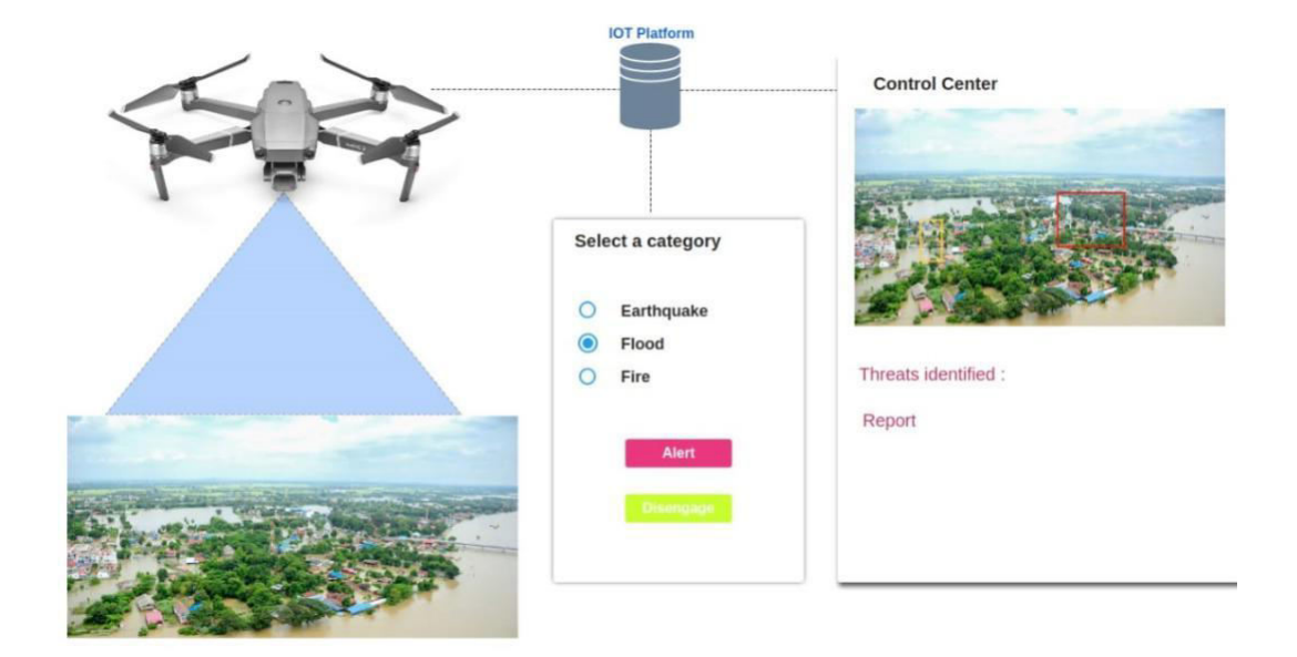
Fig 3. Proposed Working of the System