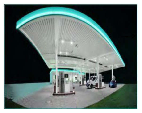
Fig. 2 Petrol Pump

The electronic valve is provided to stay the tanker opening block until it get the aperture order from the LPC2148.The RFID assembly reads the authentication code of the petrol pump by swapping the consumers tag over the RFID tagged at the petrol pump and send it to the control unit so as to update the database also on authenticate the customer who is inductively authorizing the petrol.