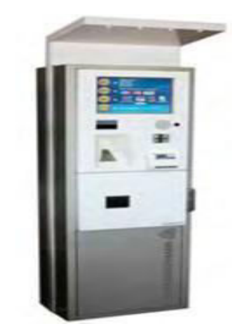
Fig. 3 Outdoor Payment Terminal OPT 240

On getting the interrupt from the control cabin unit, the valve takes action consequently. The Microcontroller perpetually sense the reserve utilizing level sensor and it keeps the valve open until it reaches the number to be distributed by reducing the counter. Here the initial reserve also because the caliber of fuel after distribution gets exhibit on the LCD screen. Additionally, the control