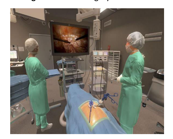
Figure 3. Using Headsets in Healthcare