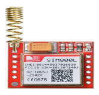
Figure 6:- GSM Module

The GSM SIM card number is already registered in the system. GSM is used to transmit data from the control unit to the base station. We can use the GSM 800A with a frequency of 900MHz. It has an uplink frequency band of 890MHz to 915MHz and a downlink of 935MHz to 960MHz GSM, with the advantages of FDMA and TDMA. In the 25 MHz BW, 124 carriers are generated with a channel spacing of 200 KHz (FDMA). Each carrier is divided into 8 time slots (TDMA). In any given instance of time, 992 voice channels are provided in the GSM 800L.