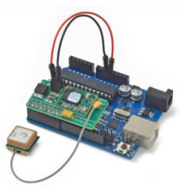
Figure 7:-GPS Module

GPS MODULE:- The Global Positioning System (GPS) is a navigation and precision positioning tool that tracks the position of the Earth's longitude and latitude based on the time difference of signals from different satellites. Arrived at the receiver. On six different orbits about 12,500 miles from Earth, 24 MEO (Medium Earth Orbit) satellites orbit the Earth for 24 hours, transmitting once per second. It receives the location and transmits it to the ATmega328 microcontroller. Therefore, the ATmega328 microcontroller receives the signal from the GPS, so it performs further operations.