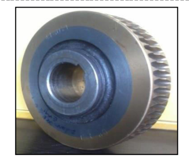
Figure 1 - Worm Wheel as a Pattern

Worm gears are that types of gears which are used to transmit power between two non-intersecting, non-parallel shafts. These gears are generally at right angles to each other. It consists of worm and worm wheel. The worm is threaded screw and worm wheel is toothed gear. The figure shows meshing of worm and wheel. The teeth on the worm wheel envelope the treads on worm. This gives line contact between mating parts. In other types of gears, the drive can be given to any one of the two mating parts. But in worm gears, the drive can be given to only worm. The worm can rotate worm wheel but worm wheel cannot rotate worm.