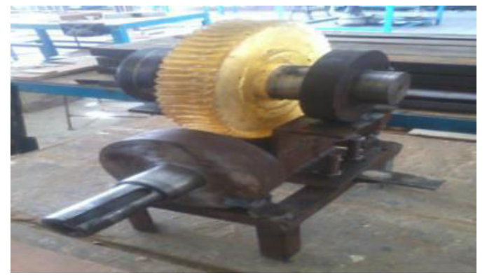
Fig 2.Photograph of Designed Loading Frame

Loading frame has to be designed and developed so as to simulate the actual loading conditions. Using loading frame, the required torque can be transferred and fringe pattern can be obtained. The figure shows the developed loading frame.