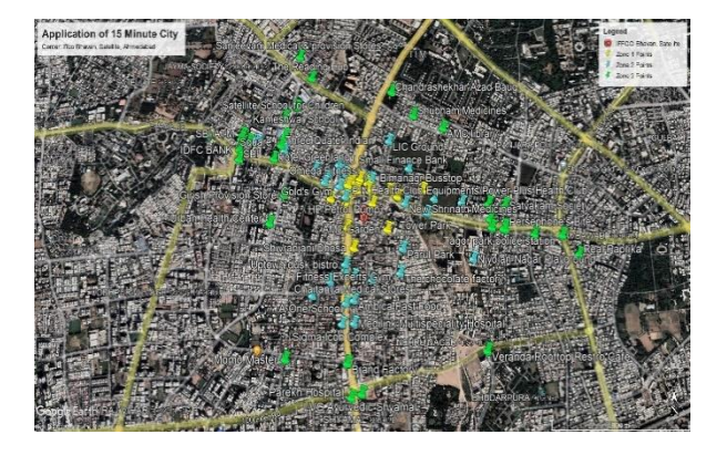
Fig.1 Amenities in the area

better life style of people, more green spaces, a healthier life, eco system friendly city, etc.