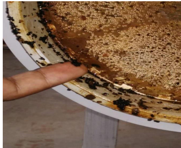
Fig-4: Clay Pallets at permeate side