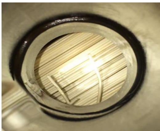
Fig-7: Cleaned Fiber in UF

Out of different combinations, SI No. 8 & 9 were found to be most effective and rapid removal of foulants was observed. Accordingly, the recovery cleaning for UF modules (Initially #B) started with the same solution in five steps each comprising soaking, air blowing with single & double blowers, forward flush (repeated several time) and back wash. After conducting continuous recovery cleanings four high pH and one final low pH cleanings, the modules were recovered to maximum possible. Picture taken through the reject port of the cleaned membrane is shown in Fig-8.