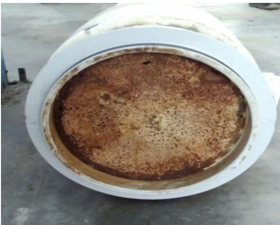
Fig-2: Severely Fouled UF Membrane

The Physical Test: 05 numbers of candles from both UF modules were removed. These were found heavily fouled with reddish brown layer as well as brownish black pallets, surprisingly at the outlet of membranes. The fibres of initial stage membranes were found broken and severely fouled. There might have been contaminant/dosing chemicals penetrated & clogs the pores of membranes. Analysis of pellets confirms the presence of clay and iron particles. The photographs depicting the state of UF membrane are shown below in Fig.-2-4: