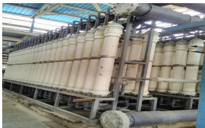
Fig-1: UF module at IGSTPS