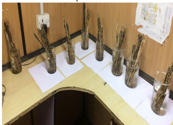
Fig-6: Lab testing of different formulations for UF recovery

SDBS = Sodium dodecyl benzene sulphonate SLS= Sodium laurel sulphate