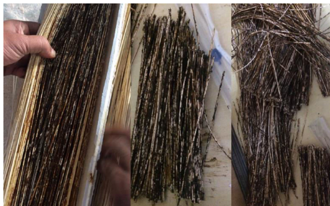
Fig-5: Photograph showing heavy fouling in UF Membranes

Step wise step to be taken to overcome the issue of fouling or improved chemical cleaning for the recovery of UF membranes