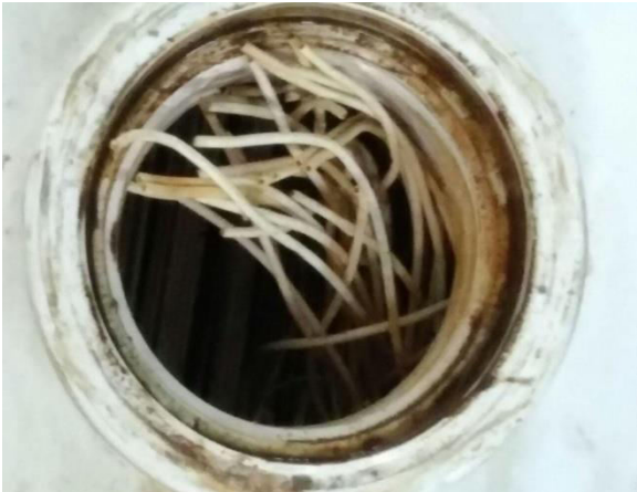
Fig-3: Broken fibers of Membrane