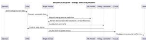
Use Case Diagram of AI-Driven HEH System.