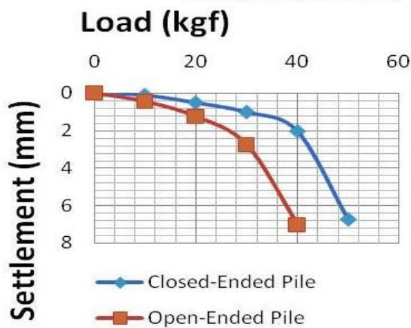
FIG 2.0 LOAD SETTLEMENT CURVES OF ALL GROUPS