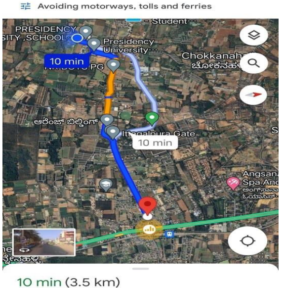
Best route now due to traffic conditions