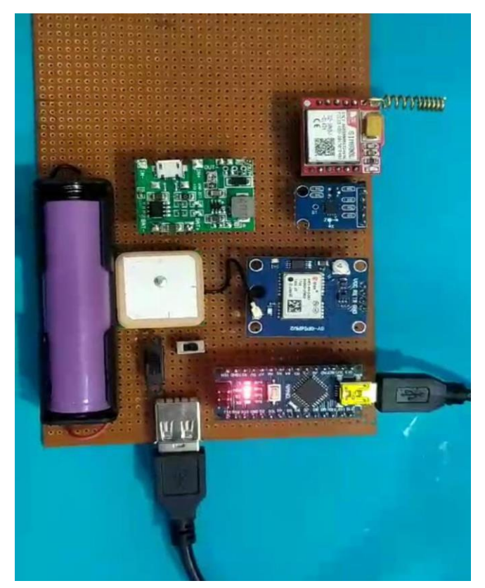
Fig 4.1 Hardware implementation

The LM2596 Step-Down Converter plays a crucial function in ensuring a steady and dependable power supply to the various components, optimizing their performance even in challenging conditions. The Zero PCB acts as a facilitator for seamless integration and organization of the circuitry, serving as a foundational platform for efficient functionality. This allencompassing system not only serves as a crash detection mechanism but also operates as a holistic solution, enhancing rider safety by delivering real-time crash information, complete with accurate GPS coordinates. This amalgamation of state-ofthe-art technology not only identifies potential hazards but also orchestrates a prompt and well-informed emergency response, contributing significantly to the overall road safety for bikers.