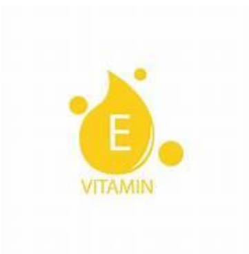
Fig 4 Vitamin E

Most people are aware of vitamin E's benefits for both the health and appearance of skin. It may be regularly applied to your face to reduce inflammation and make your skin appear younger.