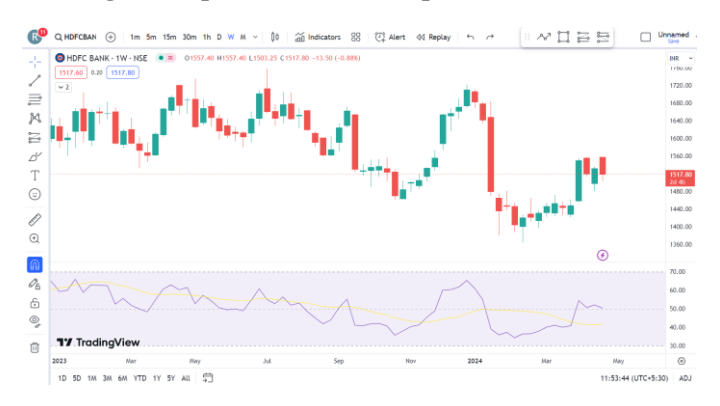
Figure 4.13 Relative Strength Index for Housing Development Finance Corporation

RSI of HDFC : The Relative Strength Index (RSI) is a momentum oscillator that measures the speed and change of price movements. It oscillates between 0 and 100 and is typically used to identify overbought or oversold conditions in a stock.