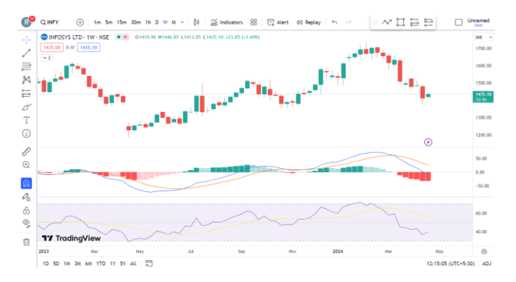
Figure 4.28 RSI MACD for Infosys

Technical Indicators : The depicted MACD of Infosys suggests a crossover from above the signal line, indicating a bearish signal, while the RSI is near 30 on the chart.