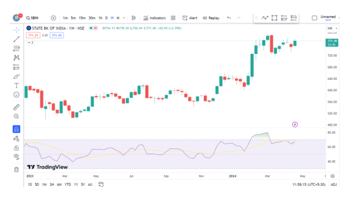
Figure 4.17 Relative Strength Index for State Bank of India (SBI)

RSI of State Bank of India (SBI): The Relative Strength Index (RSI) is a momentum oscillator that measures the speed and change of price movements. It oscillates between 0 and 100 and is typically used to identify overbought or oversold conditions in a stock.