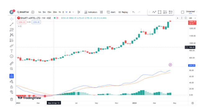
Figure 4.5 Moving Average Convergence and Divergence (MACD) for Bharti Airtel

Volume: 08 Issue: 06 | June - 2024 SJIF Rating: 8.448 ISSN: 2582-3930