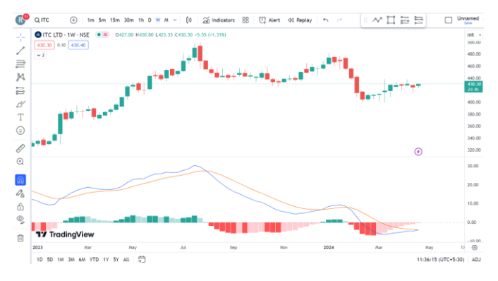
Figure 4.9 Moving Average Convergence and Divergence (MACD) for ITC

MACD of ITC : The Moving Average Convergence Divergence (MACD) indicator applied to the stock price of ITC. MACD is a momentum oscillator that helps traders identify changes in a stock's strength, direction, momentum, and duration of a trend.