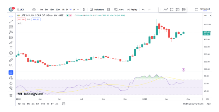
Figure 4.18 Relative Strength Index for Life Insurance Corporation of India (Source: