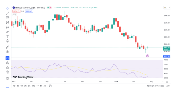
Figure 4.16 Relative Strength Index for Hindustan Unilever

RSI of Hindustan Unilever (HUL) : The Relative Strength Index (RSI) is a momentum oscillator that measures the speed and change of price movements. It oscillates between 0 and 100 and is typically used to identify overbought or oversold conditions in a stock.