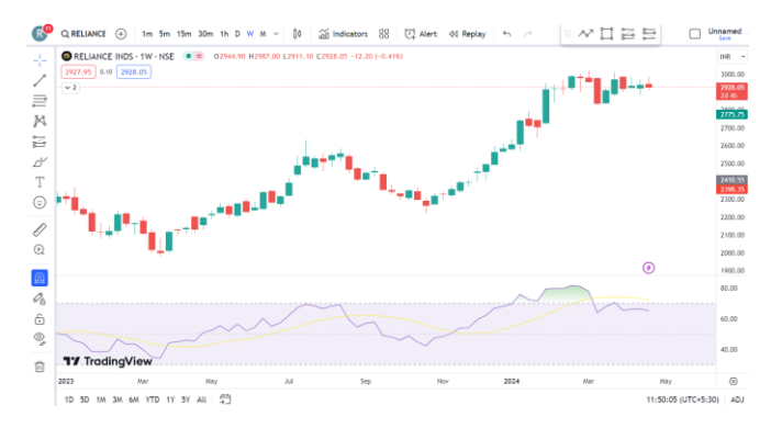
Figure 4.11 Relative Strength Index for Reliance Industries

RSI of Reliance Industries : The Relative Strength Index (RSI) is a momentum oscillator that measures the speed and change of price movements. It oscillates between 0 and 100 and is typically used to identify overbought or oversold conditions in a stock.