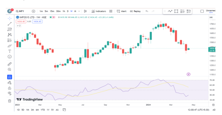
Figure 4.19 Relative Strength Index for Infosys

RSI of LIC (Life Insurance Corporation of India): The Relative Strength Index (RSI) is a momentum oscillator that measures the speed and change of price movements. It oscillates between 0 and 100 and is typically used to identify overbought or oversold conditions in a stock.