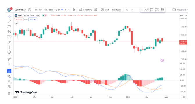
Figure 4.3 Moving Average Convergence and Divergence (MACD) for HDFC Bank

MACD of HDFC Bank : This refers to the Moving Average Convergence Divergence (MACD) indicator applied to the stock price of HDFC Bank. MACD is a momentum indicator