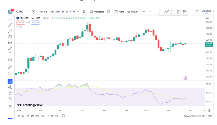
Figure 4.20 Relative Strength Index for Indian Tobacco Company Ltd

RSI of ITC : The Relative Strength Index (RSI) is a momentum oscillator that measures the speed and change of price movements. It oscillates between 0 and 100 and is typically used to identify overbought or oversold conditions in a stock.