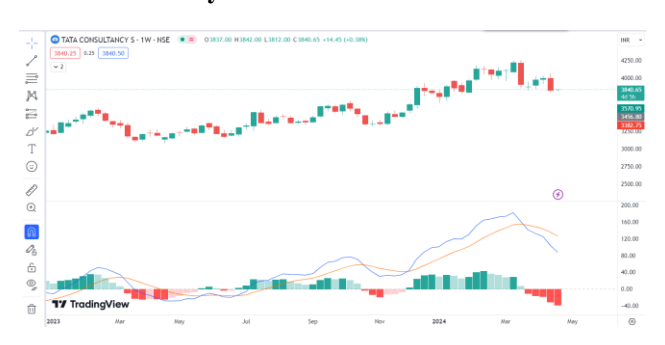
Figure 4.2 Moving Average Convergence and Divergence (MACD) for Tata Consultancy Services

MACD of Tata Consultancy Services (TCS): This refers to the Moving Average Convergence Divergence (MACD) indicator applied to the stock price of Tata Consultancy Services. MACD is a trend-following momentum indicator that helps identify changes in a security's strength, direction, momentum, and duration of a trend.