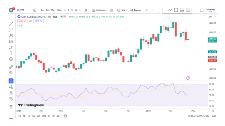
Figure 4.12 Relative Strength Index for Tata Consultancy Services

RSI of Tata Consultancy Services (TCS) : The Relative Strength Index (RSI) is a momentum oscillator that measures the speed and change of price movements. It oscillates between 0 and 100 and is typically used to identify overbought or oversold conditions in a stock.