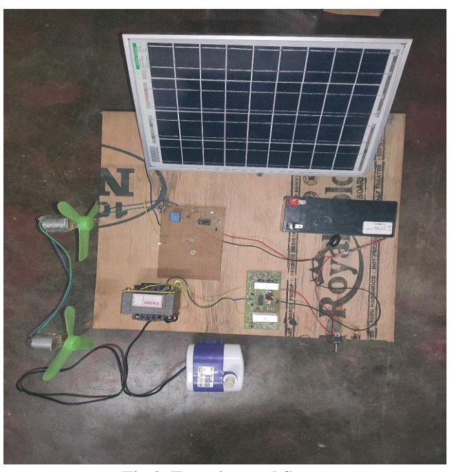
Fig 2. Experimental Setup

in ON position. The output from the secondary is 200V which is the required voltage for the pump to run.