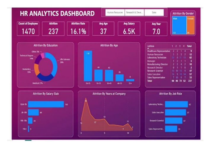
Fig 5: HR ANALYTICS DASHBOARD

Training and Development Analysis: Power BI can analyze training data to evaluate the effectiveness of training programs, identify skill gaps, and track employee development progress.