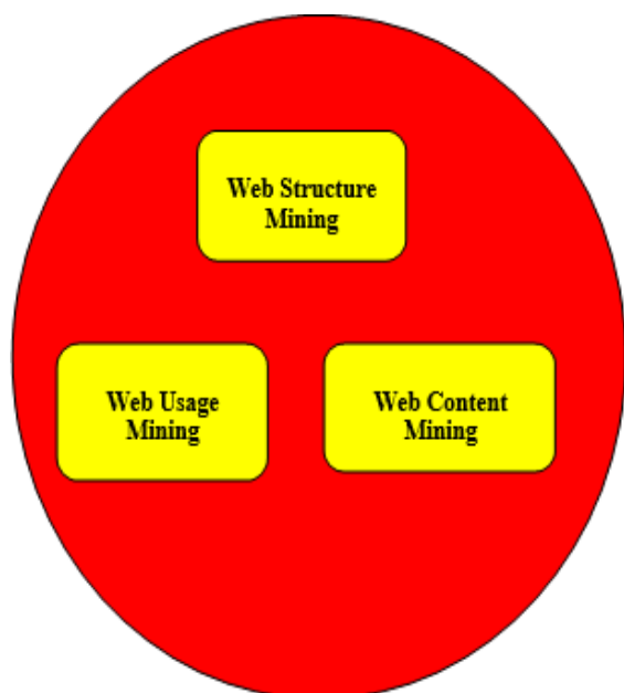
Fig.3 Subsets of Web Mining

Web content and web usage mining generally render information regarding novice and gullible web users.