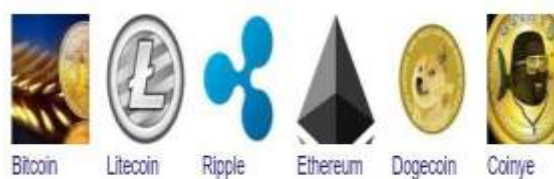
Fig.1 Common Cryptocurrencies

by traditional financial institutions. Some of the common crypto-currencies which are popular worldwide are shown in the figure below with their symbols.