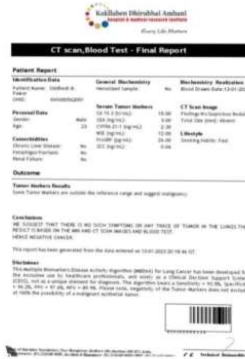
Fig 4: Medical report analyse