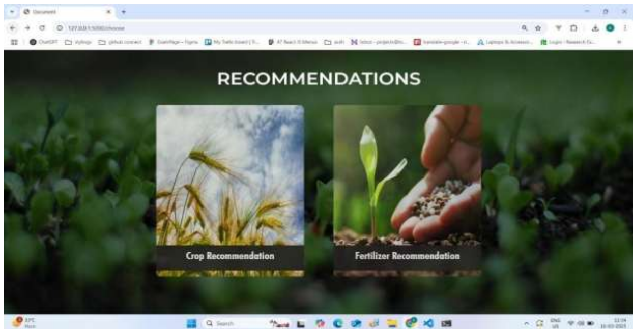
Figure 3. Recommendations