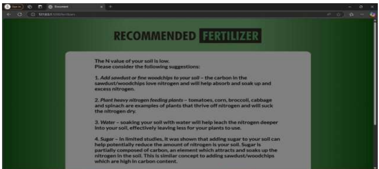
Figure 7. Recommended Fertilizer