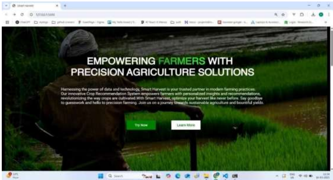
Figure 2. Empowering farmers with precision agriculture solution