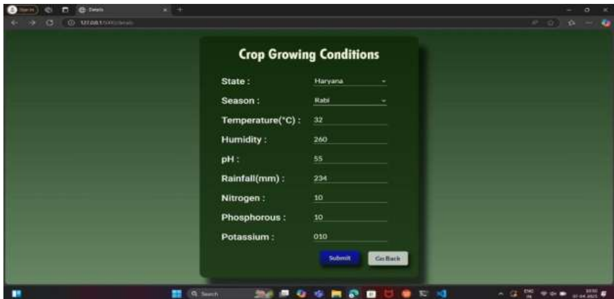
Figure 5. Crop Growing Conditions