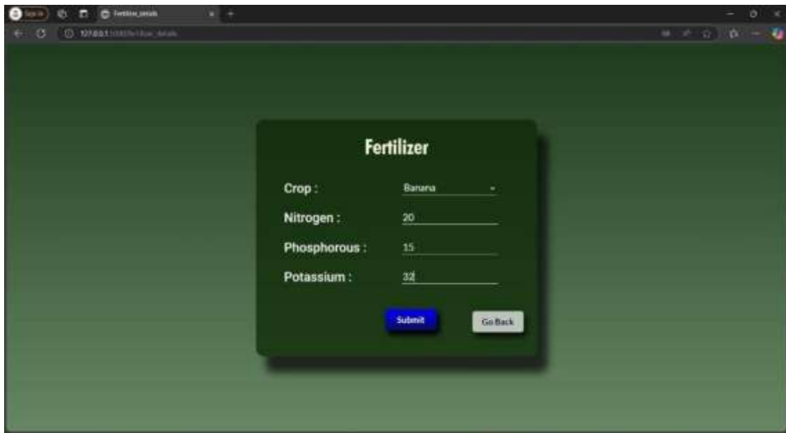
Figure 6. Fertilizer