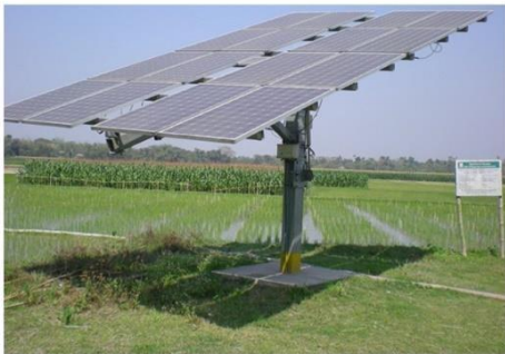
Fig 4: Implementation of Component C of PM KUSUM Scheme

Individual farmers with grid-connected agriculture pumps will be aided in their efforts to solarize their pumps under this component. The scheme allows for solar PV capacity of up to two times the pump's kW capacity. The state, on the other hand, may stipulate a lower solar PV capacity in kW, which must not be less than the pump capacity in HP in any event. It will not be less than 2 kW for a 2-HP pump, for example. The farmer will be able to use the solar energy generated to suit his or her irrigation demands, with any extra solar energy supplied to DISCOMs. This component will also include water user associations and community/cluster-based irrigation systems. Small and marginal farmers, on the other hand, would be given first attention. Farmers that use Micro irrigation systems, are covered by Micro irrigation schemes, or opt for Micro irrigation systems will be given preference in order to reduce water usage for irrigation.