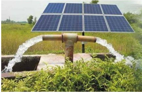
Fig 3: Agricultural Solar Pump under Component 2 of KUSUM scheme