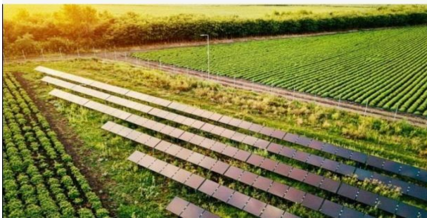
Fig 2: 105 kW developed by ICAR-CENTRAL ARID ZONE RESEARCH INSTITUTE, JODHPUR under Component 1 of KUSUM scheme

The distribution companies (DISCOMs) will inform sub-station-by-sub-station surplus capacity that can be fed into the grid from such renewable energy facilities, and will accept applications from interested parties to build the renewable energy plants. DISCOMs will acquire the renewable energy generated at a pre-determined levelised pricing.