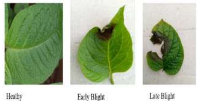
Fig.1 Heathy, Early and Late Blight Cases.