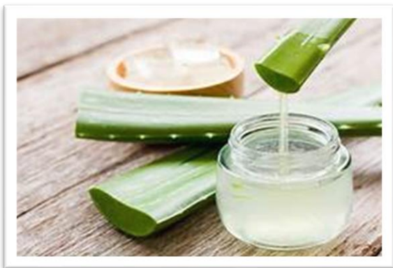
(Fig 6 Aloe vera)

Applying the extract of aloe vera on the face can help defend the skin, heal infections, and promote the development and breakdown of collagen. The herb aloe is a plant that resembles a cactus and flourishes in arid areas all over the world (8,9).