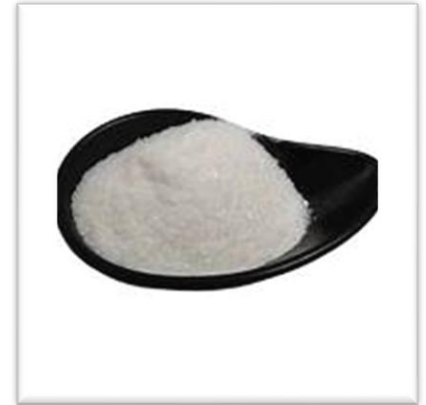
(Fig 5 Kojic acid Powder)