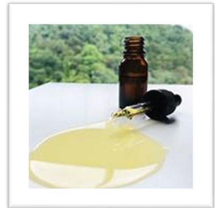
(Fig 1 oil serum)

included in the serum have moisturizing and barrier-repairing properties, but they also contain polyphenols that are fatty acids that are crucial to health, and other compounds that the skin may be able to break down (4).