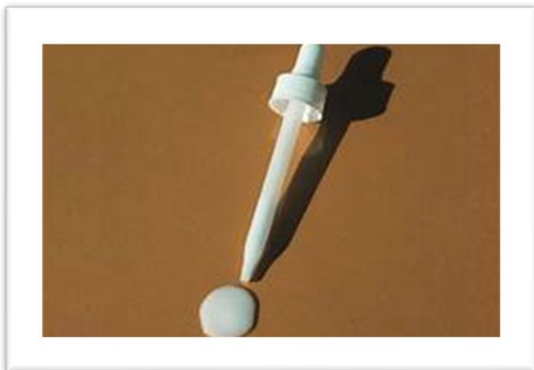
(Fig 2 Gel serum)

Gel serums give the appearance of a "tightening" feeling, making your customer feel as though certain areas of their face are briefly tightened or lifted. Because this formulation is water-based in nature the gel serum gives you the opportunity of including some amazing composed of water (hydrophilic) plant-based extracts (5).