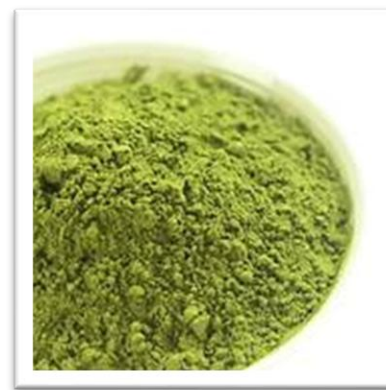
(Fig 9 Green Tea Powder)