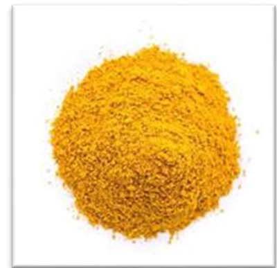
(Fig 8 Turmeric Powder)

Turmeric helps relieve roughness symptoms and profoundly moisturize and revitalize skin. This is because it naturally accelerates the elimination of dead skin cells (15,17).