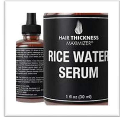
(Fig 3 Water serum)