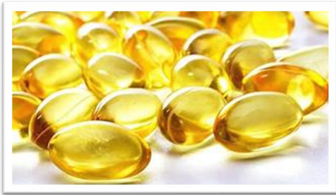
(Fig 7 Vitamin E)