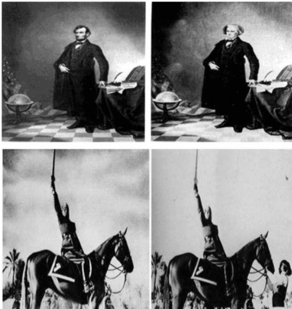
Fig.1 Illustration of typical image forgery

Image Retouching: This method involves using any advanced Image editing tool to edit and modify the images in any manner and as required. This method makes the look and feel of the image as authentic as possible. This is like a polishing of the forger image by bringing fine modification in the color, illumination etc.