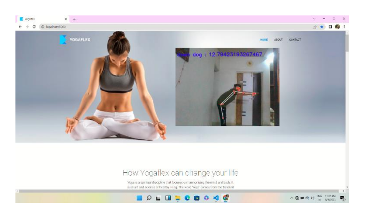
Figure 04: Down dog pose