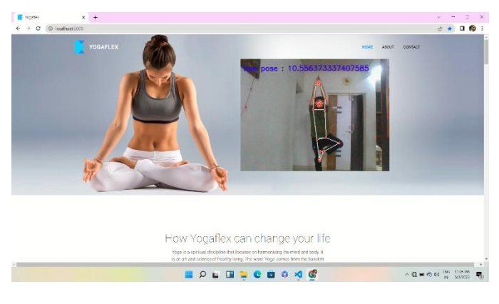
Figure 02: Tree Pose

Overall, yoga pose detection using deep learning is an active area of research with promising potential for improving yoga practice and wellness. As the technology continues to develop, it may become more widely available in the form of mobile apps, wearable devices, and other digital tools.