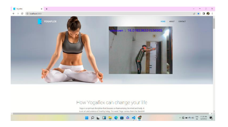
Figure 03: Unknown Pose