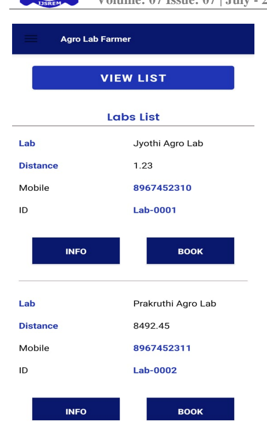
Figure 2: View List

Figure 2: Shows a list of laboratories; all laboratories are shown in this list. Labs can add their information and the location of their lab after registering for the online application with the appropriate information.