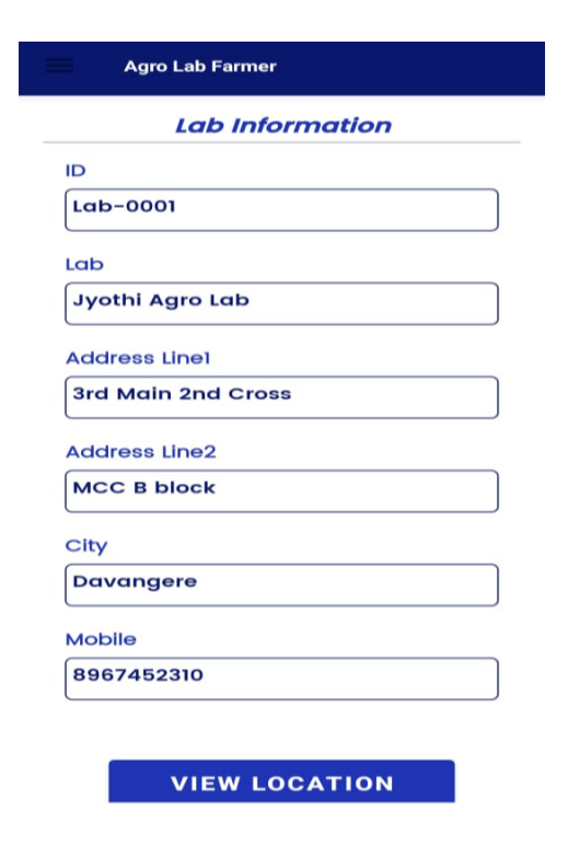
Figure 1: Lab Information

Figure 1 depicts the lab's specifics and can include all of the lab's pertinent data. This page includes the ID, Lab Name, Address, City, Mobile Number, and Lab Location. The opportunity to view the lab's location is available to users and farmers.