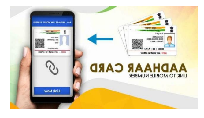
Figure 1: Linking Adhaar to Phone Number to Help Securing Hotel Residence

The Hotel Residence Verification System offers hotels a complete way to verify visitors' identity and speed up the check-in procedure. Aadhaar card verification is integrated into the mobile application, which improves security while giving consumers a smooth and comfortable experience. The below figure 1 shows the linking of adhaar to mobile number that helps in creating secure verification to the hotels for residents.