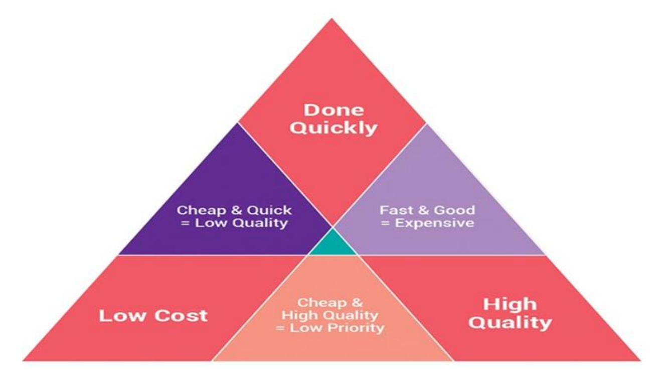
Fig 1: Decision process

All recruiting comes down to three basic decisions: 1) time, 2) cost, and 3) quality.