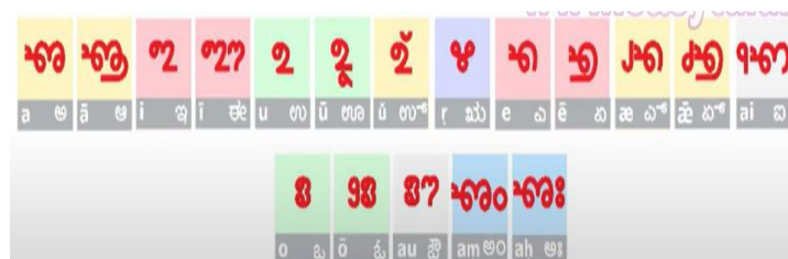
Fig- 2: Vowels of Tulu script

The Tulu-Tigalari script is used on the numerous historical Tulu inscriptions that have been discovered near Udupi and Kundapura. The Tulu script was factually used by Brahmins and Havyaka Brahmins of Tulu Nadu to compose Vedas and Sanskrit writings. Through the Grantha script, the Tulu writing is inclined from the Brahmi script. It is the Malayalam script's sibling script. Tulu script has 5 long and 5 short vowels (a, ā, e, ē, u, ū, i, ī, o, ō) are common in Dravidian languages. There are totally 36 consonants in Tulu.