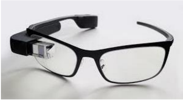
Figure 1: Google Glass