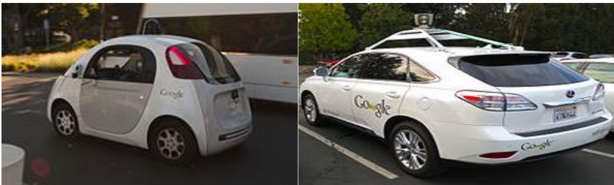
Figure 2: Google Driverless Car

The Google Self-Driving Car, commonly abbreviated as SDC, is a project by Google X that involves producing technology for autonomous autos, mainly electric cars. The software powering Google's automobiles is called Google Chauffeur [F1]. Writing privately of each car determines it as a "self-driving car".