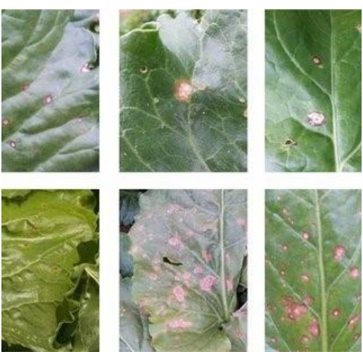
Fig1.1: Diseased Plant leaves

Automatic identification of plant diseases is an important task as it may be proved beneficial for farmer to monitor large field of plants, and identify the disease using machine learning approach .As compared to image processing technique using machine learning approach manual disease identification is less accurate and time consuming.