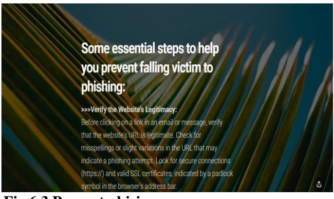
Fig 6.3 Prevent phising page

Fig 6.1 represents the page where what is phising url detection is explained.