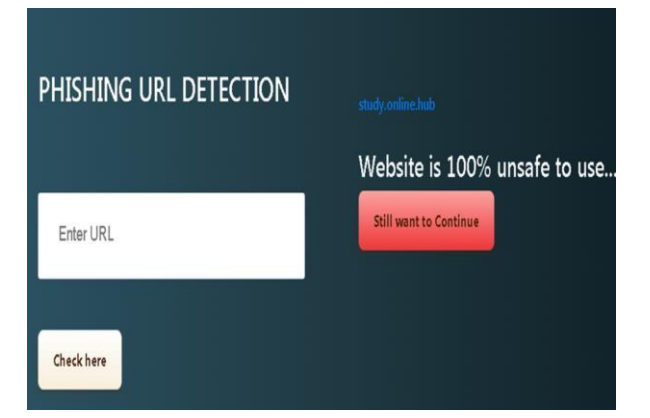
Fig: 6.5 Phising url detected.

Fig 6.5 represents the url which is detected as unsafe url to use.