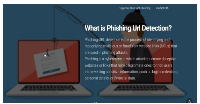
Fig 6.2 About page

Fig 6.1 represents the home page of our website