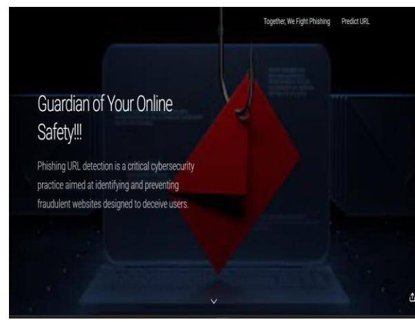
Fig 6.1 Homepage

Fig 6.1 represents the home page of our website