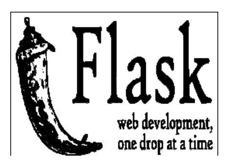
Figure 5.1- Flask Image