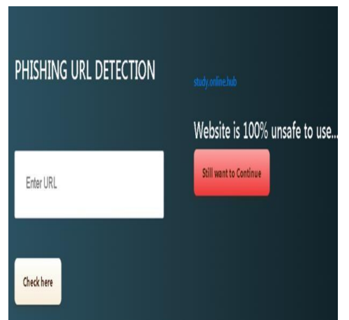
Fig: 4.2 Phising url detected.

Fig 4.1 represents the url which is detected as safe url to use.