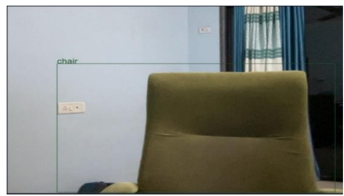
Fig -2: Detection of Chair