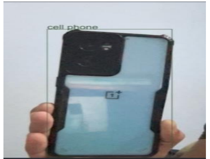
Fig -3: Detection of Cell Phone

One rainy evening, as the sky darkened and the streets emptied, a young girl named Lily found herself standing before the old house. She was a curious soul, always seeking adventure where others saw danger. Ignoring the warnings of her friends, she pushed open the rusty gate and ventured inside.