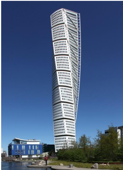
Figure 6 Turning Torso Building