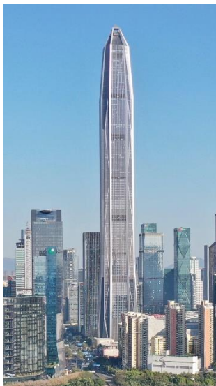
Figure 9 Ping An Finance Centre

Another example is the Ping An Finance Center in Shenzhen, China. The building's tapered shape and distinctive design were the result of extensive aerodynamic testing. By simulating wind flows around different building shapes using CFD, engineers were able to identify the optimal shape for reducing wind loads.