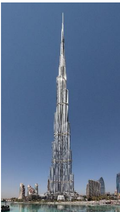
Figure 3 Burj Khalifa