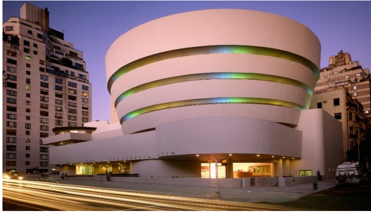
Figure 5 Guggenheim Museum Bilbao