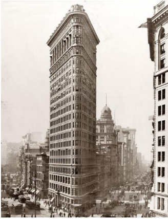
Figure 1 Flatiron Building

Other examples include the John Hancock Center in Chicago and the Burj Khalifa in Dubai, both of which use tapered shapes to reduce wind loads.