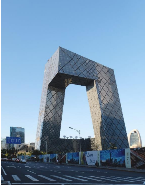
Figure 7 CCTV Headquarters Beijing