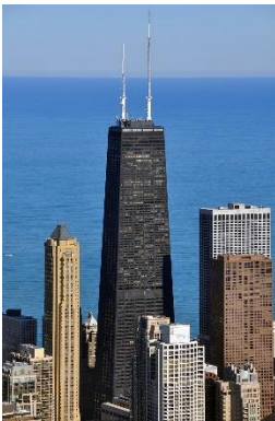
Figure 2 John Hancock Center

Other examples include the John Hancock Center in Chicago and the Burj Khalifa in Dubai, both of which use tapered shapes to reduce wind loads.