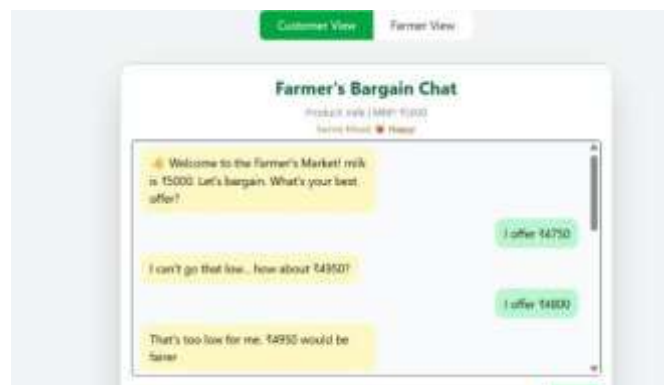
Fig.(b) Online Bargain box

The AI-based Disease Detection (a) module allows farmers to upload a photo of a diseased leaf and receive an instant diagnosis along with recommended treatments.