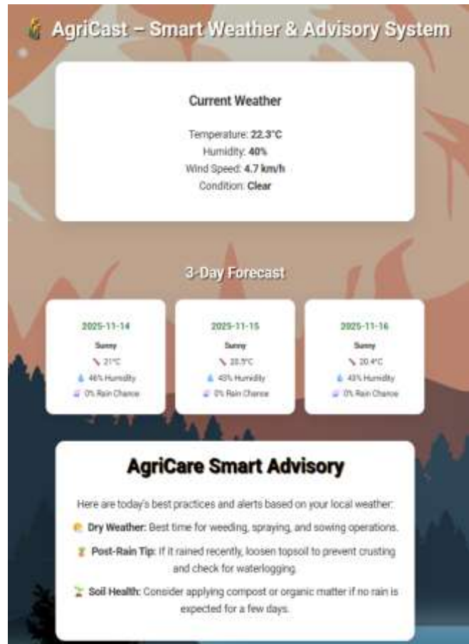
Fig.(e) Weather Advisory

seamlessly toggle between English and Marathi, ensuring inclusivity and usability for all.