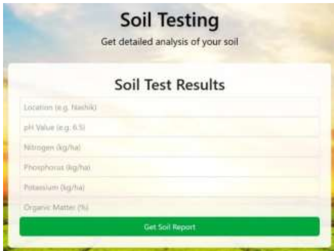
Fig.(d) Land Preparation

Complementing this is a Live Auction System (c) that lets farmers participate in real-time bidding to secure the highest possible prices. For land preparation, the Interactive Land Preparation Guide offers step-by-step, crop- and region- specific instructions to help farmers optimize soil management practices.