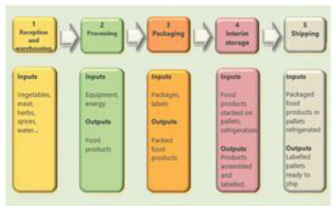
Fig -1: Execution Model

Determining what the Traceable Entities are is a major part of creating a dynamic traceability model for a particular value chain. For example if the production batches are too big or there is too much mixing occurs during production, the precision of the traceability system will be compromised (Dupuy et al., 2005). Therefore it is important to analyze the current production practice within the organization as well as how TRUs are defined. If it is needed, necessary adjustments have to be made to implement an effective traceability system. According to Moe et al. (1998), defining the TRU for continuous processing can be challenging. It may depend on how the raw material TRU was received and or on a change in processing conditions such as the clean out process for production equipment.