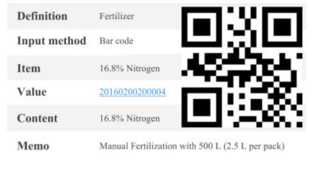
Fig -3: Diagram for the product traceability system automatically generating a QR code

With the operation methods designed in the system, the administrator can conveniently operate the system; the number of required work tools or materials can be added or deleted, and QR codes are easily generated and printed on the work zones in accordance with the demand, which significantly simplifies the procedures and reduces the difficulties of operations for the administrator