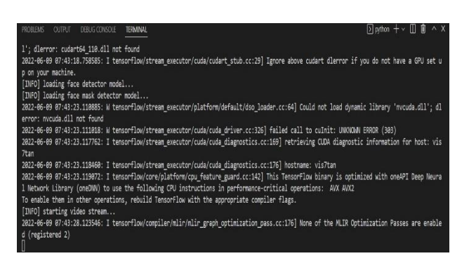
Fig: 2 Running Of Model