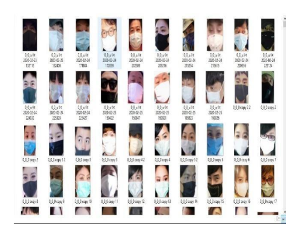
Fig:3 With & Without Mask – Output