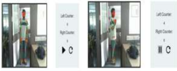
Fig. 3. Exercise Tracking Interface with Repetition Counter

The diet recommendation feature has been well-received, with users reporting improved eating habits and progress toward their ideal BMI. The automated grocery list generation simplifies meal planning and adherence to dietary recommendations.