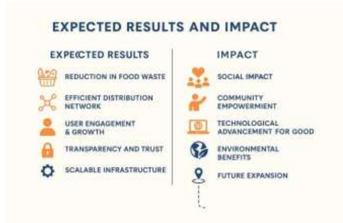
Figure 2: Expected result diagram

These are the real metrics. These are the true results. And this is the quiet revolution After Stars is designed to lead—not with noise, but with nourishment.