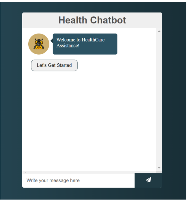
Figure 3. Screenshot 1