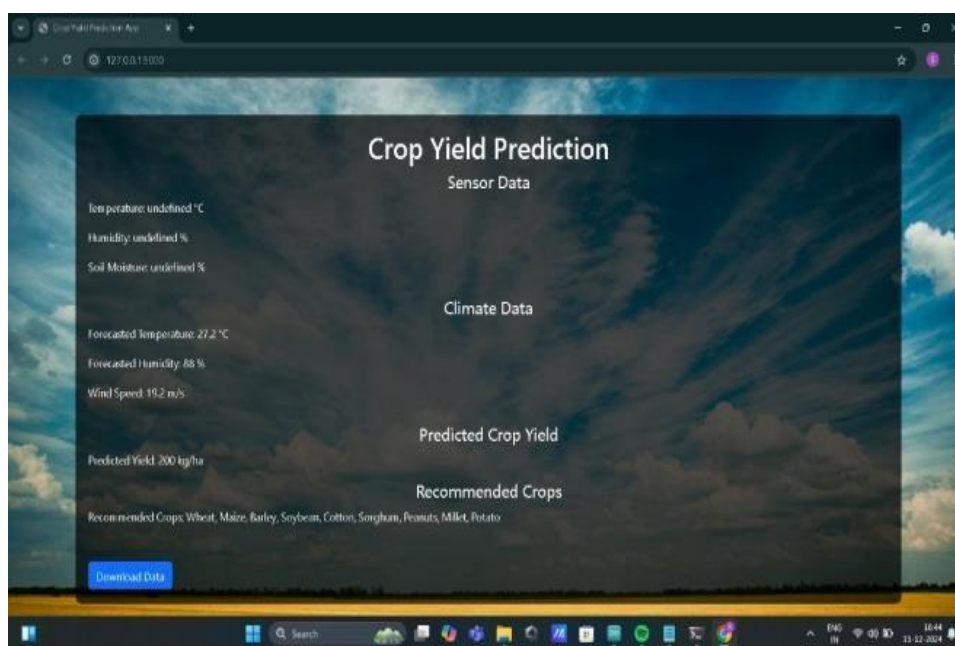
Figure 3 OUTPUT

On the software side, the Flask framework provided a seamless user experience. The web-based interface was responsive, allowing users to access data and insights quickly, with minimal load times. The integration of AI models within the Flask app enabled the generation of actionable insights, such as weather predictions, irrigation schedules, and crop recommendations, all delivered in real time. The system's scalability was proven during deployment to the cloud, where it efficiently handled data from multiple sensors, with no noticeable performance degradation. Security measures like SSL encryption and user authentication ensured safe data transmission and access. The integration of Edge AI provided real-time decision-making capabilities, enhancing the system's responsiveness and reliability in time-sensitive tasks.