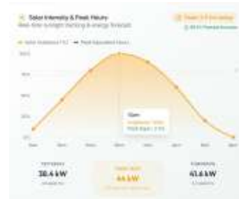
Fig. 3. AI Energy forecasting

energy conservation efforts that could result in significant monetary savings for end-users. This project presents a smart system for forecasting and optimizing solar energy usage using AI and machine learning techniques. The system analyzes environmental data such as sunlight and temperature to predict solar energy generation and provide useful suggestions for efficient energy utilization. The results show that intelligent prediction models can help improve solar energy management and reduce dependence on conventional electricity. Overall, the proposed system provides a simple and effective solution for better utilization of renewable energy.