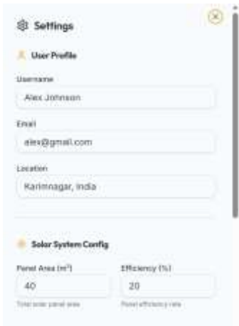
Fig. 7. Solar system configuration settings