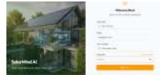
Fig. 2. Solar Mind interface

Illuminating suggestions for how to efficiently utilize energy will also be generated from the forecasted solar energy values. Testing results showed that solar energy forecasts were greatest during peak hours of sun, with lower estimates for before sunrise and after sunset. Knowing when solar energy will be available provides exact guidance on optimal times to operate electrical devices, which leads directly into major