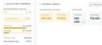
Fig. 5. Visualization of solar and grid energy consumption