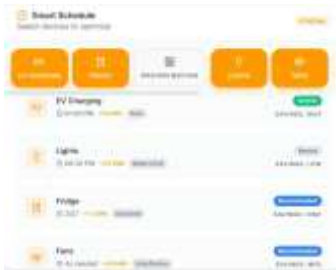
Fig. 6. Smart appliance scheduling based on solar energy