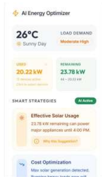
Fig. 4. AI-based energy optimization interface

energy conservation efforts that could result in significant monetary savings for end-users. This project presents a smart system for forecasting and optimizing solar energy usage using AI and machine learning techniques. The system analyzes environmental data such as sunlight and temperature to predict solar energy generation and provide useful suggestions for efficient energy utilization. The results show that intelligent prediction models can help improve solar energy management and reduce dependence on conventional electricity. Overall, the proposed system provides a simple and effective solution for better utilization of renewable energy.