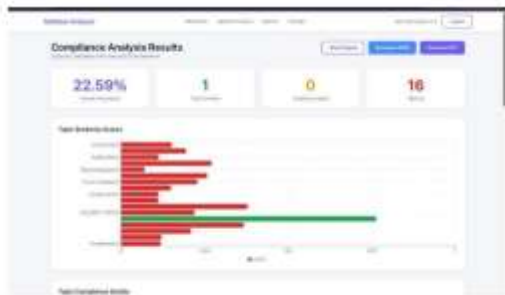
Fig 4: Compliance Analysis Results

The system provides an interactive interface where users can securely log in, upload syllabus documents and teaching materials, and perform automated compliance analysis. The output displays the overall compliance percentage along with the number of fully covered, partially covered, and missing topics. It also presents detailed topic-wise similarity scores and matched content segments. Additionally, the system generates AI-based recommendations to help improve coverage of missing or weakly addressed topics, enabling better curriculum alignment and academic quality improvement.