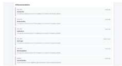
Fig 6: AI Recommendation