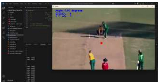
Fig 2: Ball Detection