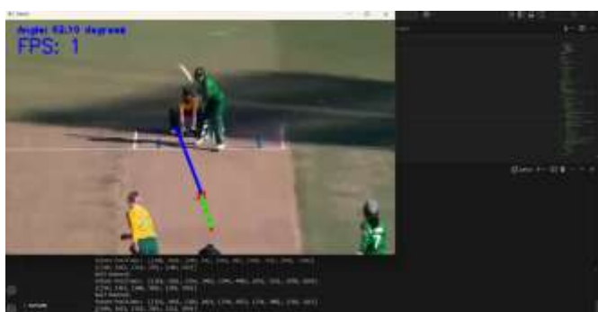
Fig 4 : Direction Detection