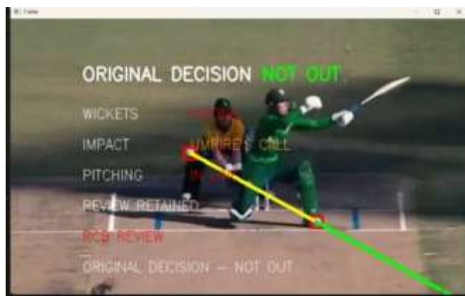
Fig 7: Out or Notout decision