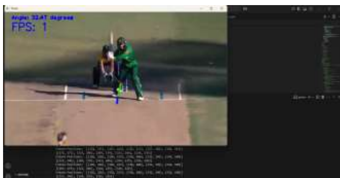
Fig 5: Decision Making