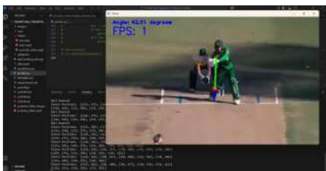
Fig 3 : Ball Tracking