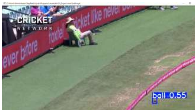
Fig 6: Boundary checking