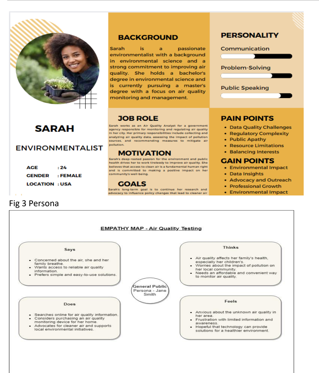
Fig 4 Empathy Map