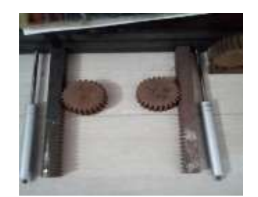
Figure 2: Component Position