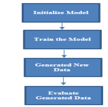
Figure 2: Generative AI Architecture

subset of artificial intelligence known as "generative AI" is dedicated to creating new data instances that bear similarities to a given dataset. Generative AI models seek to discover and replicate the underlying patterns and structures of the training data in order to generate new and distinct data instances, in contrast to other AI techniques that concentrate on categorization or prediction tasks. Artificial Intelligence Algorithms make use of statistical methods and probabilistic models to comprehend and record the distribution of data. By assimilating the patterns, correlations, and dependencies found in the training data, these models are able to samples comparable produce fresh data with