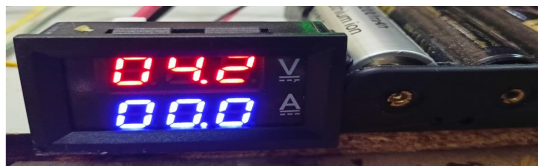
Figure 4 : Display Reading 3 On burning waste papers voltage generated is as shown in Fig 5