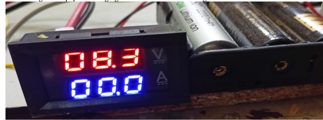
Figure 5 : Display Reading 4