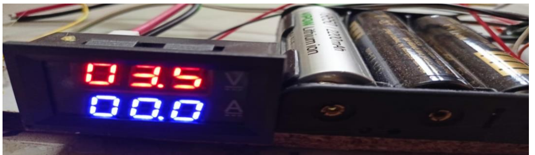
Figure 3 : Display Reading 2 On burning dry leaves voltage generated is as shown in Fig 4

On switching the toggle switch, now the display shows the voltages generated by the solar panel on burning wastes in the zaar box.