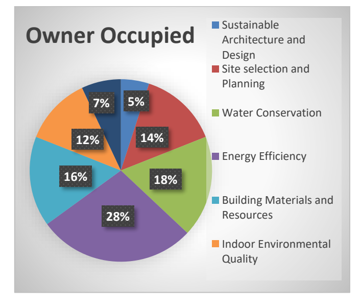
Chart 1: Owner occupied