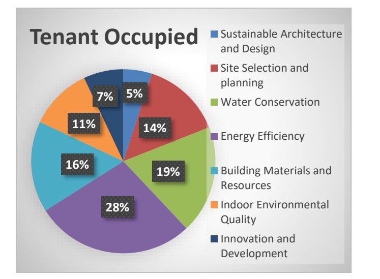
Chart 2: Tenant occupied